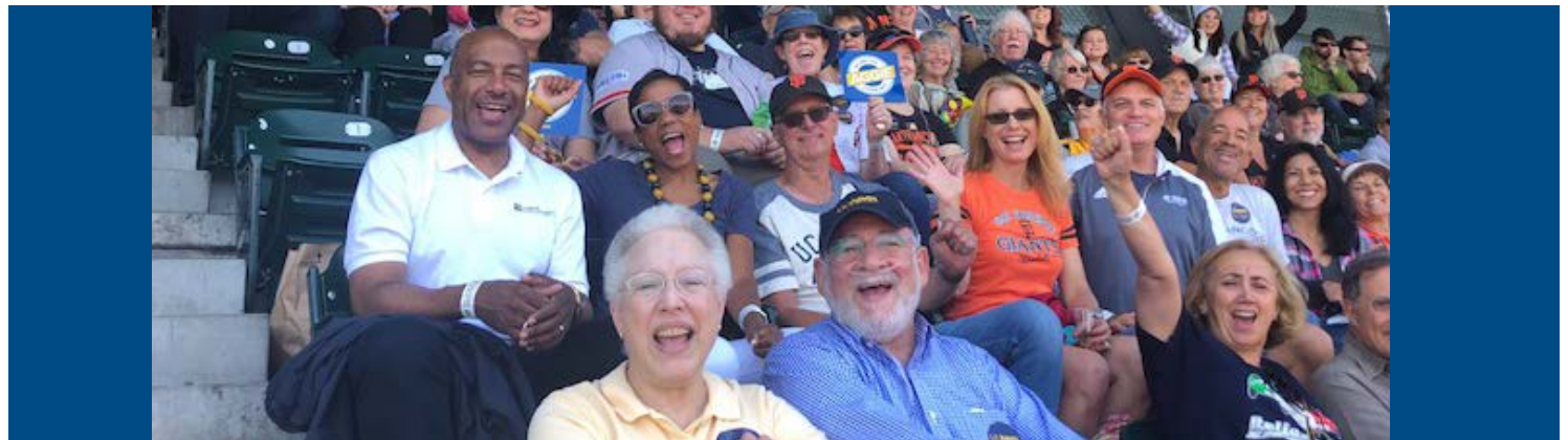
Retirees joined with alumni at a San Francisco Giants baseball game in August 2018.